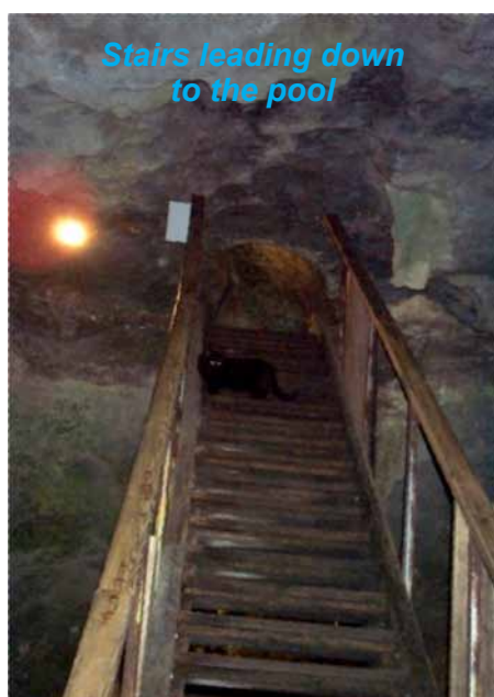
Stairs leading down to the pool