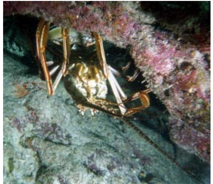
Molasses Goliath Inverted-Brat