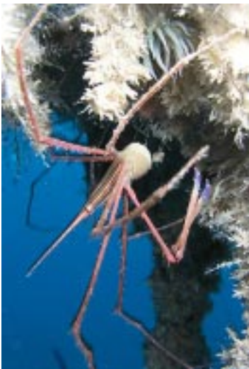
Yellowline Arrow Crab

For our trip, however, Tavernier in the Florida Keys continues to prove that it has something for everyone when it comes to water sports and scuba diving. The Conch Republic Divers operation ( www.conchrepublicdivers.com ) was able to arrange an Advanced PADI class for one MDC member and additional optional trips to meet the desires of everyone: Friday afternoon, Saturday morning, Sunday pre-dawn, and Sunday afternoon, plus snorkeling.