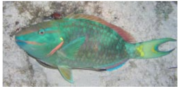
Sleeping Rainbow Parrotfish