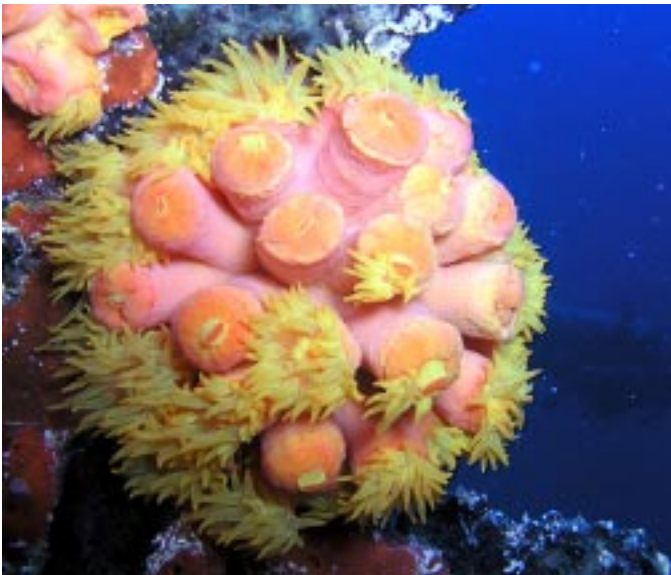
Orange Cup Coral on the 'Duane'