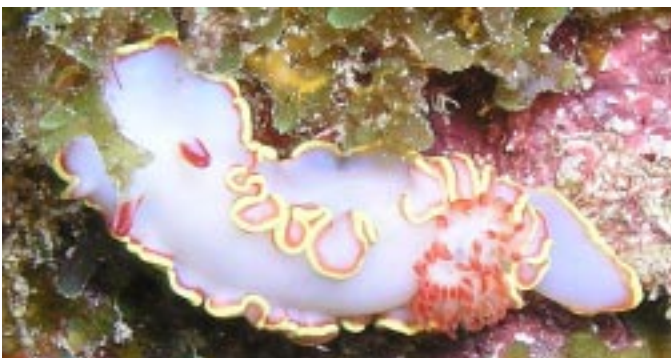
Red-tip Sea Goddess Nudibranch

around with our flashlights, verified that parrotfish and grouper do sleep with their eyes open; and then, as the sun began to rise, saw a dramatic ten-fold increase in marine life as it awakened. It was also much easier to find the boat than during a sunset dive. The red-tip sea goddess picture was from that pre-dawn dive (good eyes, George).