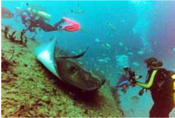
Last Year's Photo Contest, Second Place Winner - Beginner!!

Lauderdale-by-the-Sea is blessed with two close-in reef lines that are an easy swim from the beach. We'll dive in groups with a flag on a float, but the schedule is flexible.