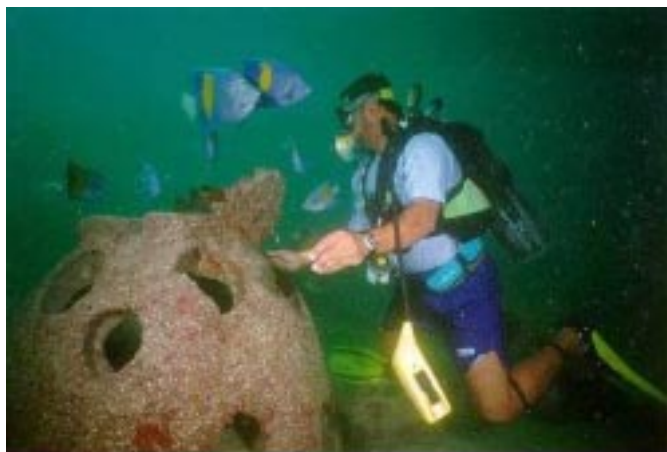
MARTIN DIVE CLUB 'News'