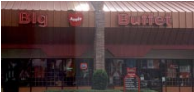
The Big Apple Buffet