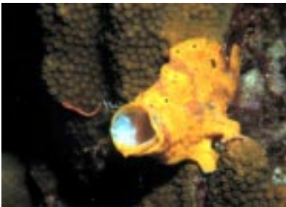
Yellow Frogfish First Prize, Most Unusual 2001 MDC Photo Contest