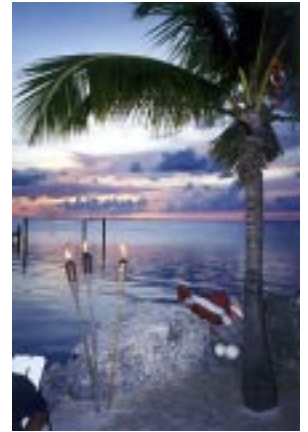
Florida Bay from the Lookout Lodge