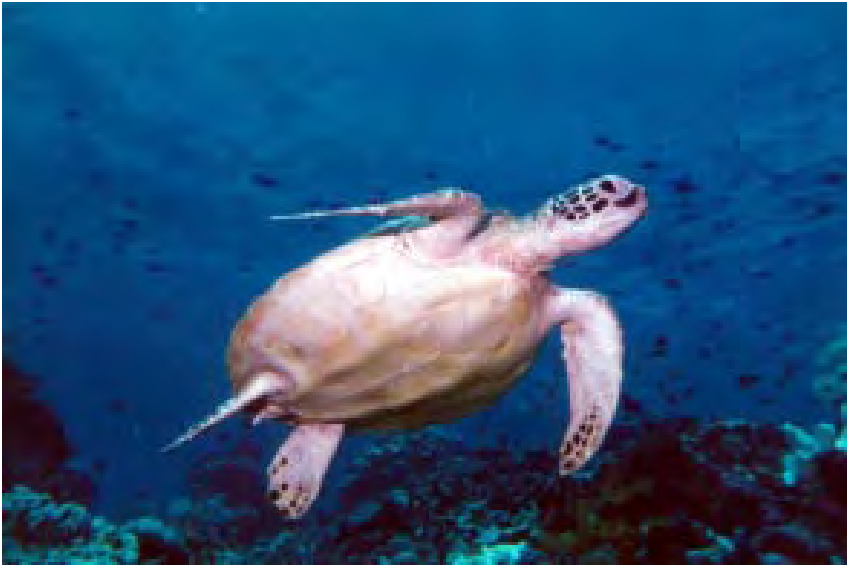
First-time entry: Lisa Dilabio-Knapp, "Turtle, Nov 98, Sipadan, Malaysia"