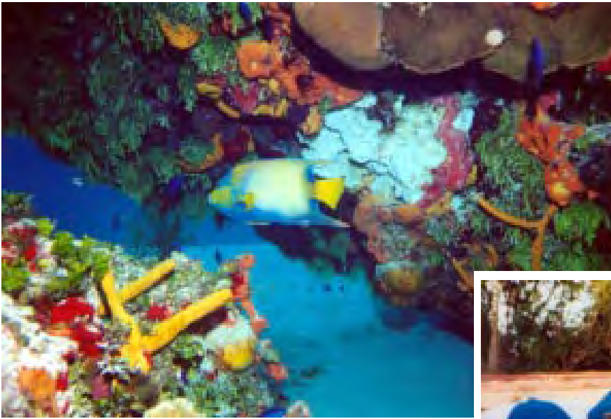
Underwater, fixed focus: Bob Iacovazzi, "Regal Beauty"