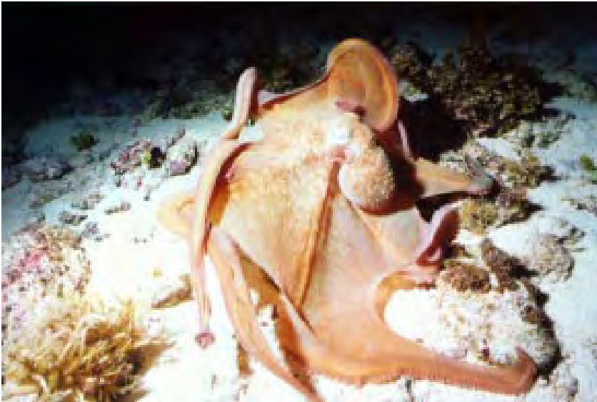
Underwater, normal or wide angle

At the CLUB 's January meeting, the results of our annual photo contest were (finally) presented. As you may recall, this was scheduled to take place at the November meeting, but due to delays in the US Postal Service, the results were lost in the mail. But, two months later, what an event it turned out to be!