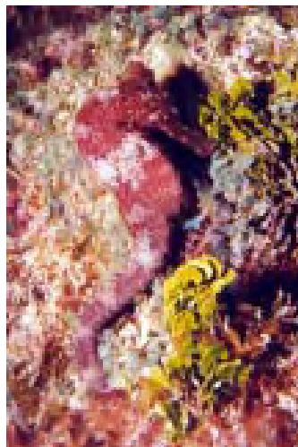
Seahorse right off the resort shore