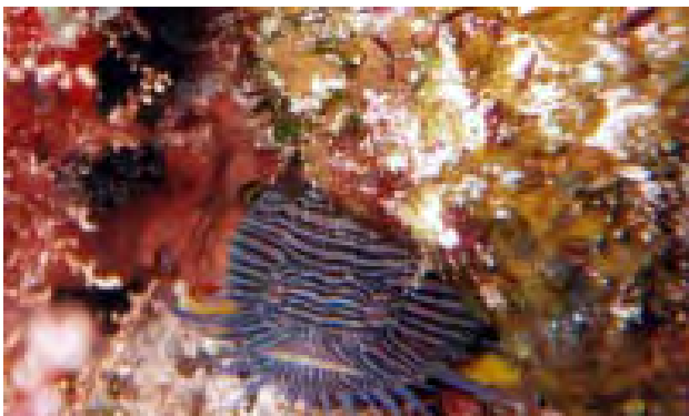
Splendid Toadfish, found nowhere else in the world other than Cozumel