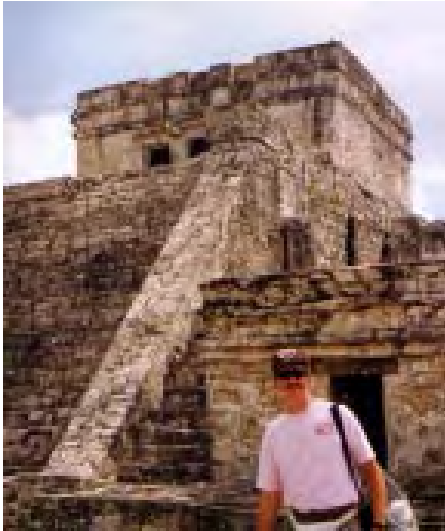
Mayan ruins at Tulum

Mayan ruins and rich with history. The large structures stand on high embankments above a beautiful Caribbean beach.