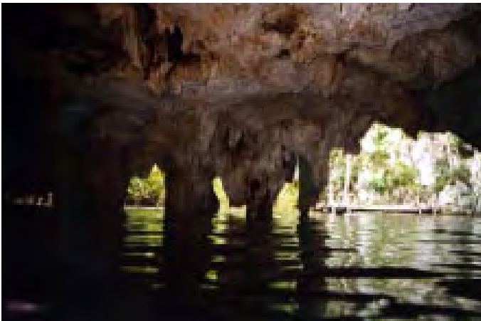
El Grand Cenote provided clear water and interesting formations

After perusing the ruins thoroughly, we proceeded to El Grand Cenote, a large and beautiful sinkhole well known in the spring and cave diving community. We snorkeled around in the cool water and took in the unusual sites of the crystal clear water and large stalactites and stalagmites.